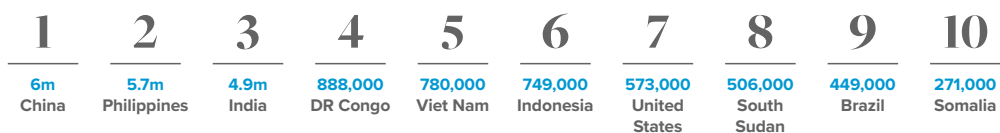
Figure 14: Ten countries with the most internal displacements by disasters in 2021

Despite a less intense hurricane season in the Americas, and less rainfall in sub-Saharan Africa and the Middle East and North Africa, all three regions were hit by severe droughts and extreme temperatures that led to hundreds of thousands of displacements. The dry conditions also fuelled other hazards such as wildfires, which forced more people from their homes. Europe suffered weather extremes which caused heatwaves, wildfires and heavy flooding that led to more than 261,000 displacements, an increase compared to 2020.